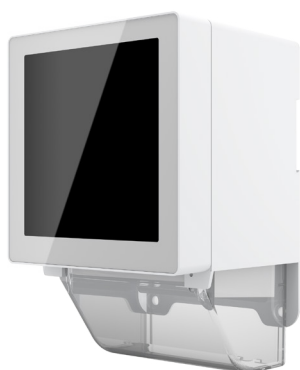
Tesseract – Panel Mount Setup