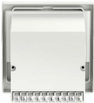
Tesseract – Rear View