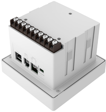
Tesseract – Input/Output Port