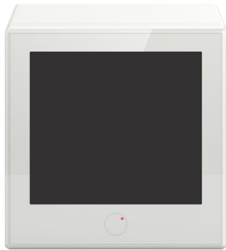
Tesseract IoT Device

The patent pending Tesseract is your next generation platform for smart energy management.